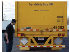
Left Turn, 1.5 seconds

Every Express Garage comes with our excellent Scanner Lighting System Tester built right in. A Scanner makes the light testing job a lot easier.