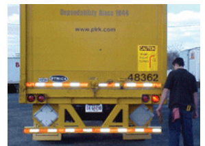
Right Turn, 1.5 seconds