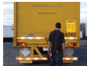
Stop Lights, 3.0 seconds