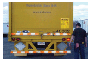
Right Turn, 1.5 seconds