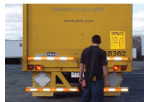
Stop Lights, 3.0 seconds