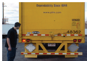
Left Turn, 1.5 seconds

Express Mobile comes with our excellent Scanner Lighting System Tester built right in. A Scanner makes the light testing job a lot easier.